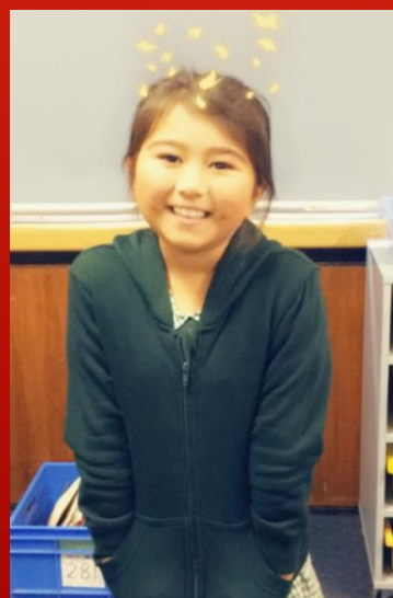
Thamana as Twinkle